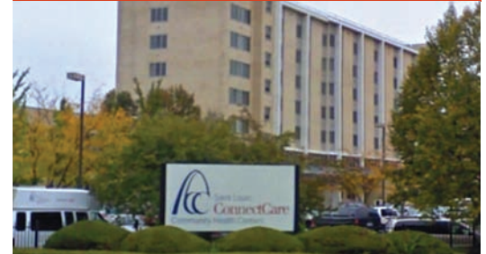
Saint Louis ConnectCare St. Louis