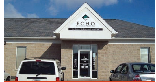
ECHO Community Health Center Evansville, Indiana