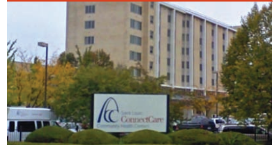
Saint Louis ConnectCare St. Louis