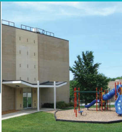
Brookside Day School, Kansas City, Missouri