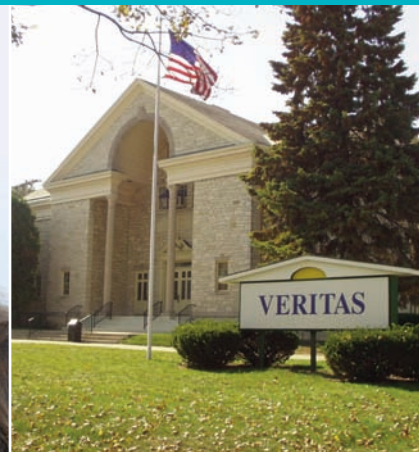
Seeds of Health, Veritas High School, Milwaukee

American Quality Schools knew they needed to renovate Plato Elementary School, located in Chicago, before the start of the school year—but tightening credit markets left AQS uncertain as to whether they could finance renovations. That's when IFF stepped in to help. IFF provided an affordable loan so AQS was able to welcome their students back to a new-and-improved facility after summer break.