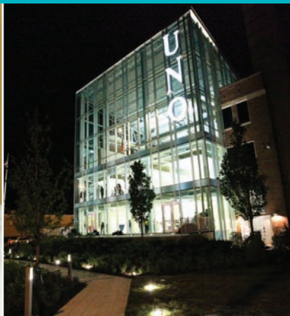
UNO Charter School Network, Veteran's Memorial Charter School Campus, Chicago