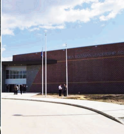
Drexel Foundation for Educational Excellence, Thea Bowman Leadership Academy, Gary, Indiana