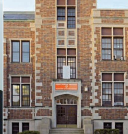
Asian Human Services, Passages Charter School, Chicago