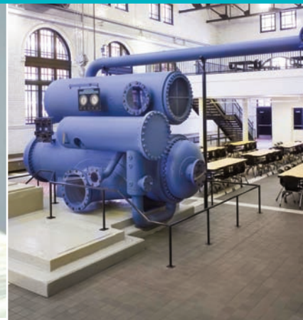
Charles H. Shaw Technology and Learning Center, Chicago